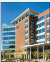
■ Golden Brick Award Blue Cross/Blue Shield Building