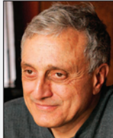
■ Lifetime Achievement Award Carl Paladino President, Ellicott Development Co.

The Brick by Brick awards offer you the opportunity to meet and share in the success of Western New York's most successful architects, engineers, developers and contractors of the Buffalo Niagara region.